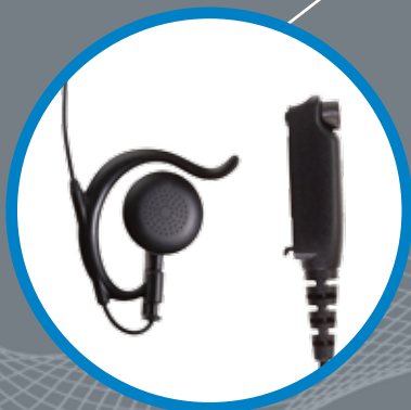
ONE-WIRE EAR HANGER